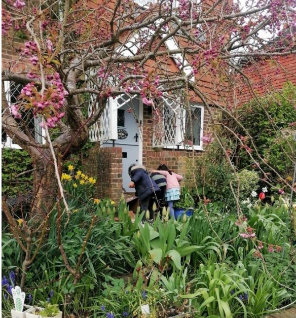
The Easter Egg Hunt